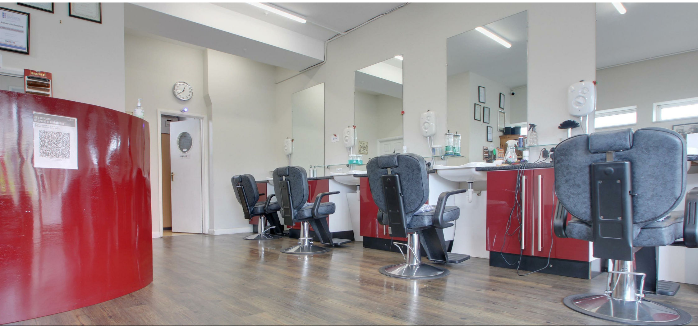
4 Brooklyn Chambers Worthing, BN11 5QR Asking price £25,000